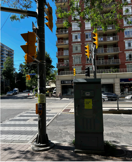
Location: St. Clair Ave. W. + Deer Park Cres. Dimensions: W33" x D18" x H82"