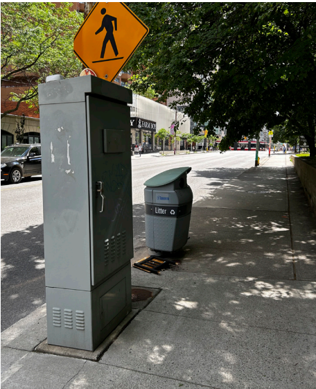
Location: St. Clair Ave. E. + Avoca Ave. Dimensions: W30" x D17" x H82"