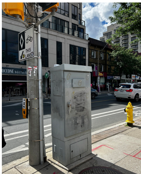
Location: Yonge St. + Rosehill Ave. Dimensions: W29” x D18” x H75”