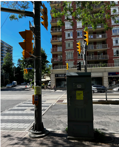
Location: St. Clair Ave. W. + Deer Park Cres. Dimensions: W33” x D18” x H82”