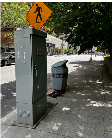
Location: St. Clair Ave. E. + Avoca Ave. Dimensions: W30” x D17” x H82”