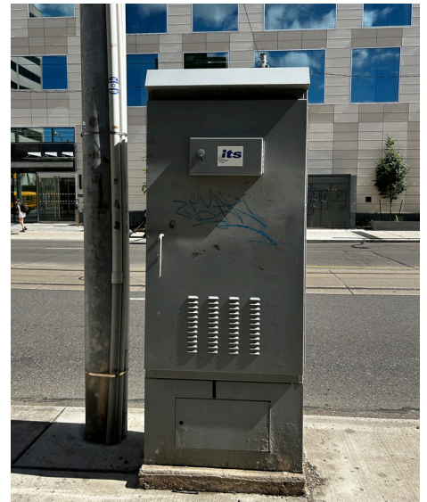
Location: St. Clair Ave. E. + Ferndale Ave. Dimensions: W33” x D18” x H82”