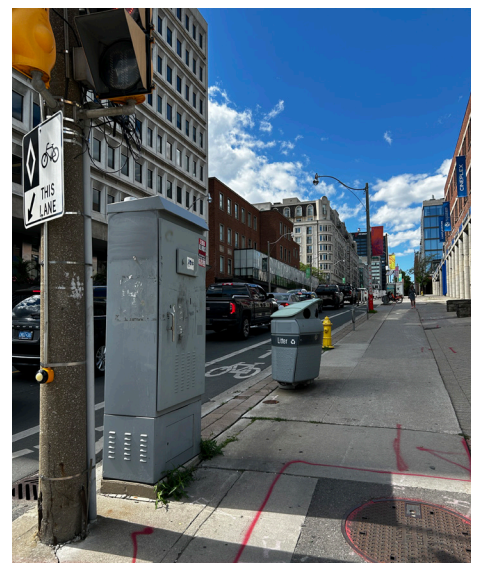
Location: Yonge St. + Woodlawn Ave. E. Dimensions: W33” x D18” x H82”