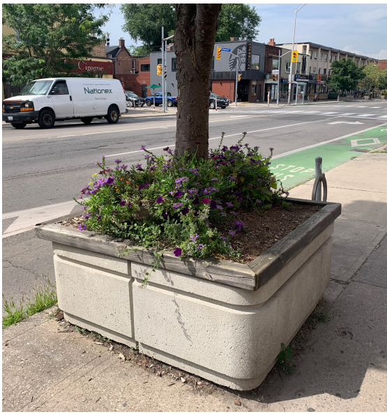
Above ground concrete planters make up the majority of the BIA's streetscape (165)