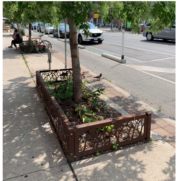
The BIA also has an estimated 46 steel tree guard planters.