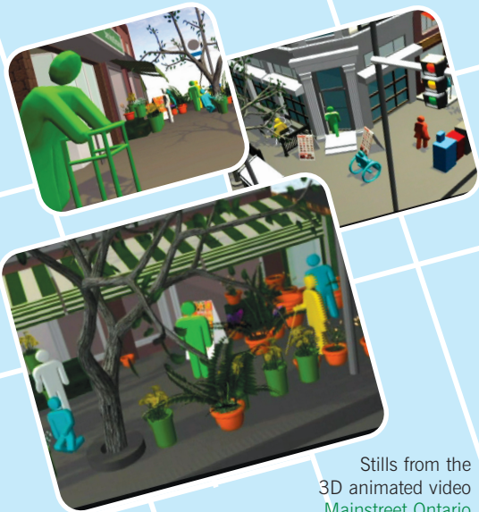
Stills from the 3D animated video Mainstreet Ontario produced in partnership with Youth View Communications

Eligibility is open to any small business or community within the province of Ontario that has improved service or access for individuals living with a disability. All nominees must provide service within the province of Ontario. The contribution does not have to be in the year previous to the award date.